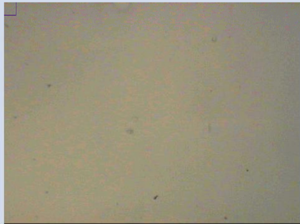
Image: 6 weight % of MLa 43 and dispersion 1, 40 x objective (1,65 x 1,37 mm)