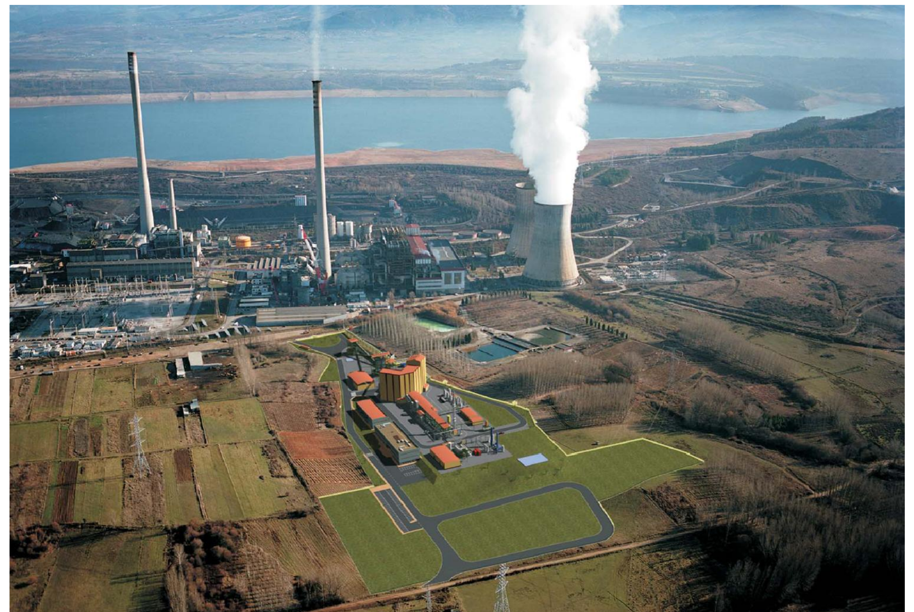
CIUDEN CCS large scale test Platform which is close to Compostilla Power station.

The primary novelty of the proposed technology is in the full utilisation of all of the new CFB design and process advancements when merging a CFB boiler with a supercritical once through steam cycle and air separation unit together with CO 2 capture unit for CCS. This encourages utilities to take the new technology, which has the built-in capability for CCS, into use and to decommission old, inefficient and highly polluting capacity with lower efficiency and worse emission performance. In air-firing, the higher efficiency has a direct impact on CO 2 emissions due to the reduced consumption of fuel. In addition, by substituting 20% of the coal input with renewable fuels CO 2 emissions can further be reduced by 15-20%. Furthermore, the air/oxy flexible CFB concept is capable of CCS whenever the CO 2 storage is available. At a power plant with full CCS capability, the air/oxy flexible CFB concept serves as a risk mitigation tool that enables power generation during temporary outages of the CO 2 transport and storage facilities. Such features are expected to facilitate investment decisions for highly capital-intensive CCS power plant projects.